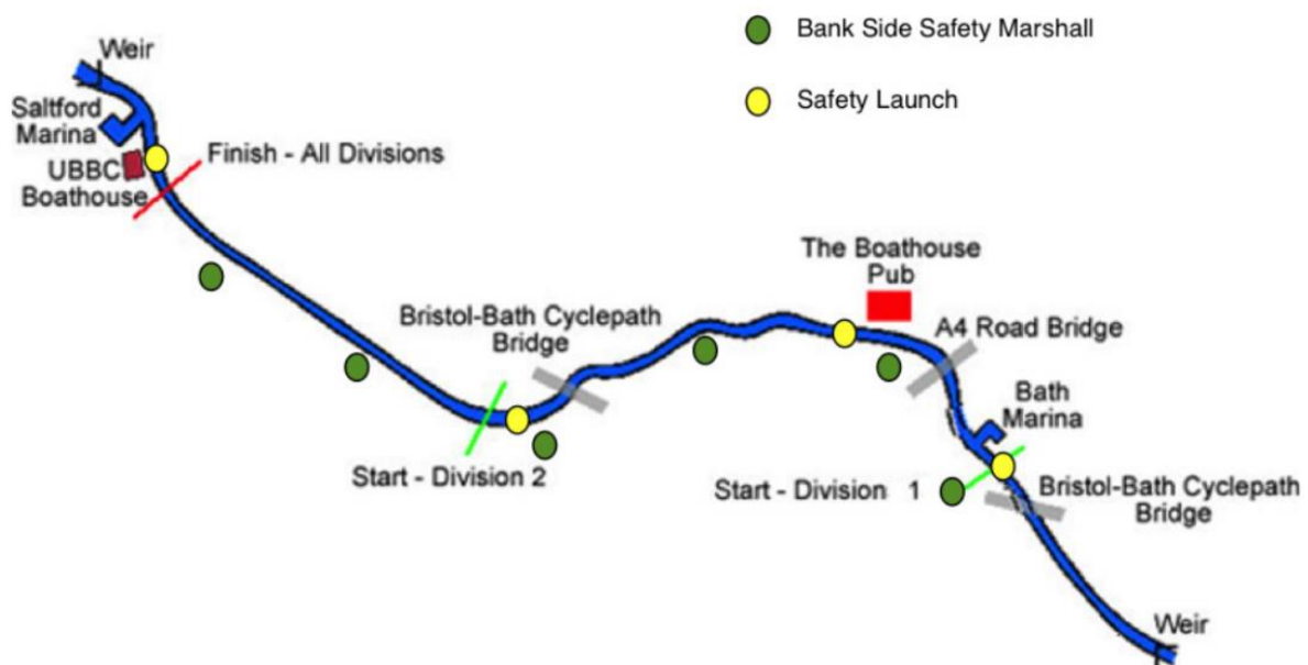
Figure 3: Map of the Course

Division 2 will be marshalled upstream of the first rail bridge, again with highest numbers furthest upstream. Once a crew has passed the starters at the bend at the end of the straight, they may only paddle at light pressure (no bursts) to ensure safe entry into the marshalling area.