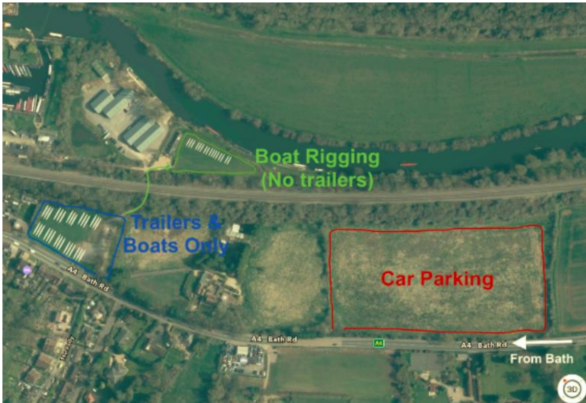
Figure 1: Parking Map